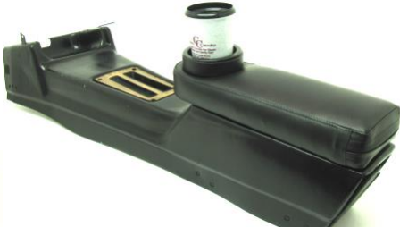
Finished installation of the 7381 Holdster™ Armrest