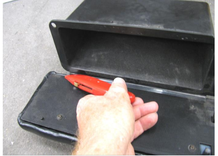
Illustration # 2