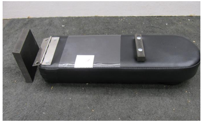
Illustration # 4