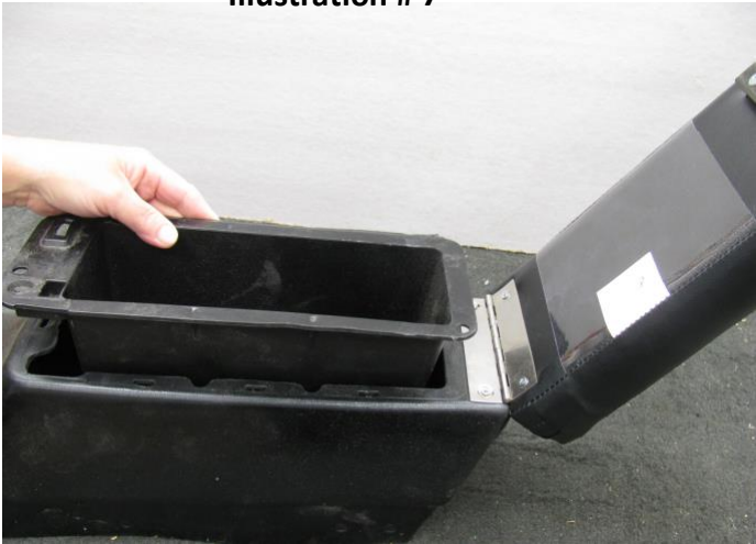
Illustration # 7