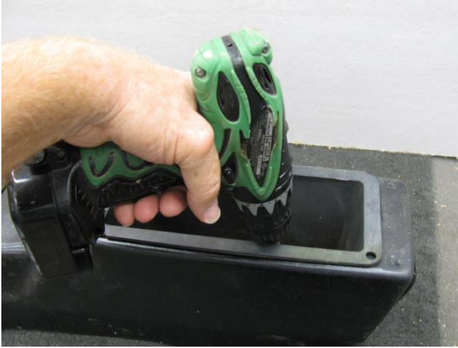
Illustration # 1

You are now ready to cruise with your new Holdster™ armrest! Questions ? Please call our tech support at 1-229-377-6240