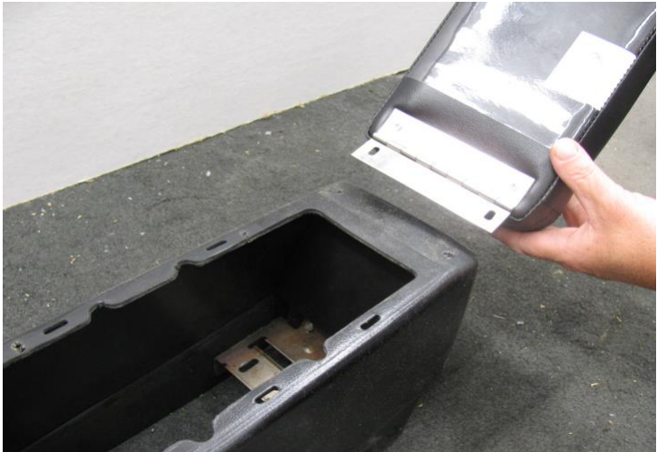
Illustration # 6