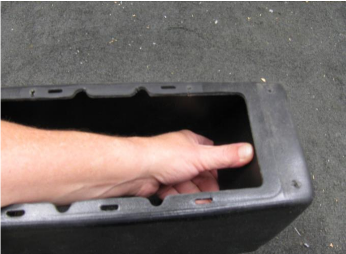
Illustration # 5