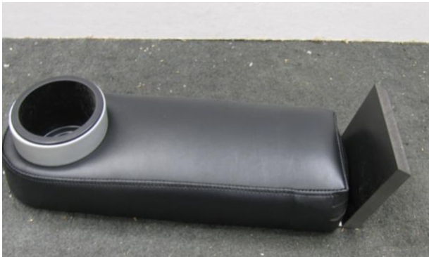
Illustration # 3